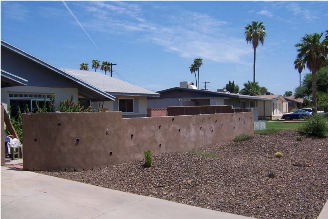
APPROVED MODIFIED WALL HEIGHT, PER CONDITIONS